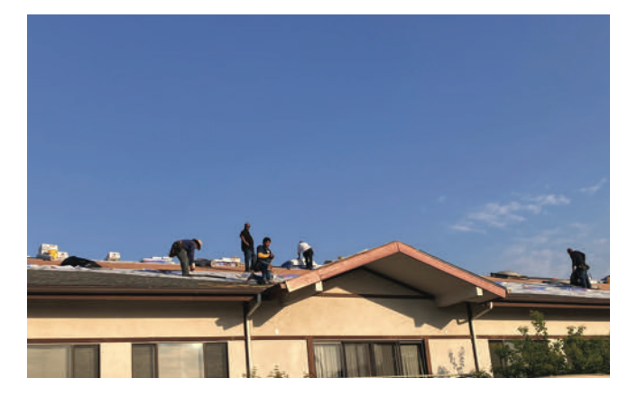
BGA America Convention at the Mission HQ!